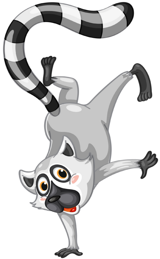
Wk 5 - K-3 - Bamboo Cards