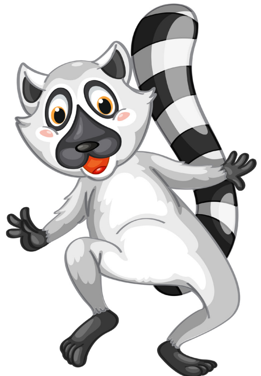
Wk 5 - K-3 - Bamboo Cards