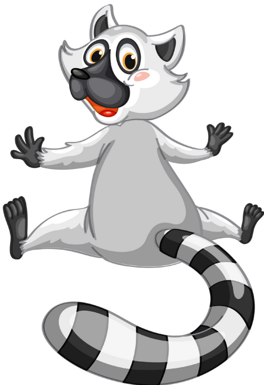
Wk 5 - K-3 - Bamboo Cards