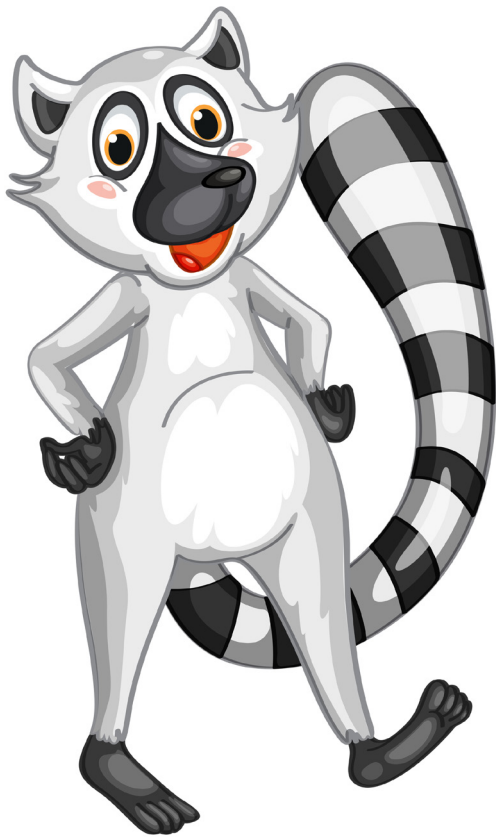
Wk 5 - K-3 - Bamboo Cards